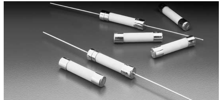
326 000 Series